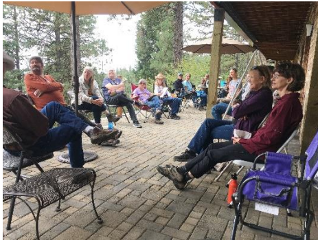
Figure 10 A short member meeting to elect the 2020 slate of officers