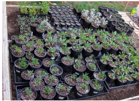
Figure 1 Plants grown by Jen Hiebert

We are grateful to our many plant donors and the vendors who continually impress us with the quality of the plants they provide for us to sell.