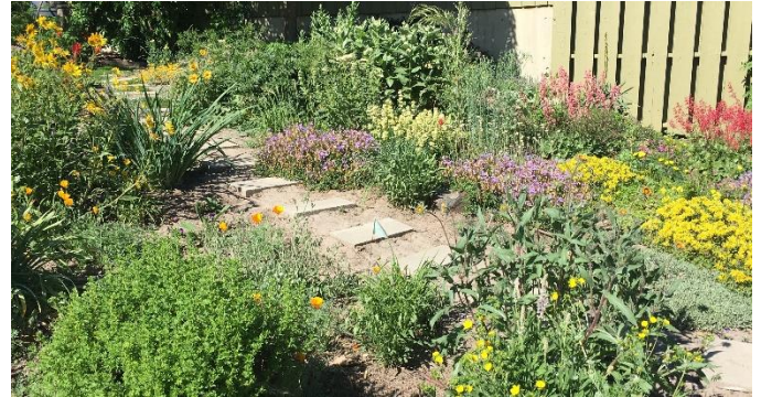
Figure 13 Native flora in Anke's garden

walks next spring and summer to see how others have incorporated natives into their city gardens or have tackled significant prairie restoration.