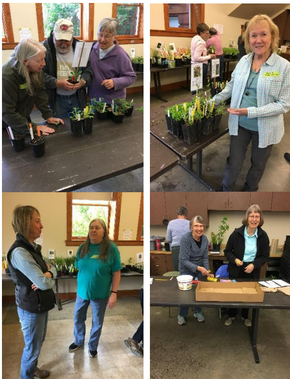
Figure 4 Relaxing after the sale

The May 18 th Annual Plant Sale was very successful thanks to lots of volunteers who helped from the starting of native plant seeds to the cashiering and cleaning up at the end of the sale. Co-chairs Charlotte and Nancy are very grateful for everyone's help in every phase of the project. Over 2000 native plants were sold and it was exciting to see the enthusiasm of the buyers. The sale cleared over $3000 to add to the chapter's funds which support our grant program and donations.