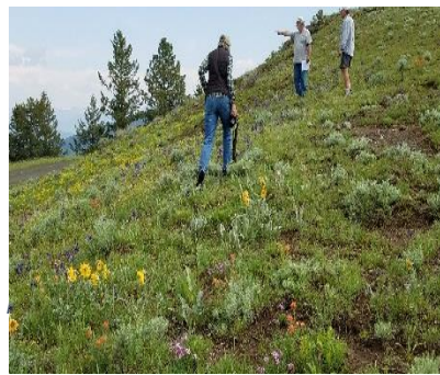
Figure 3 With Mike we always need to look over there!

We are grateful to our many plant donors and the vendors who continually impress us with the quality of the plants they provide for us to sell.