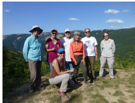
Figure 9 Group photo of Calypso and White Pine hikers.