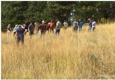
Figure 11 Palouse prairie grassland