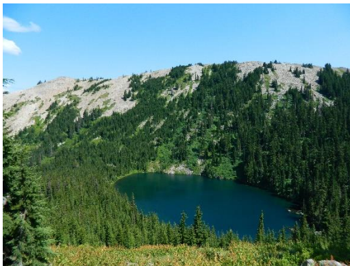
Figure 8 Crystal Lake by Mike Hays

Here's the link for the September Sage Notes which is referenced several times. Great writeups from our members! ( https://idahonativeplants.org/sage-notes/ )