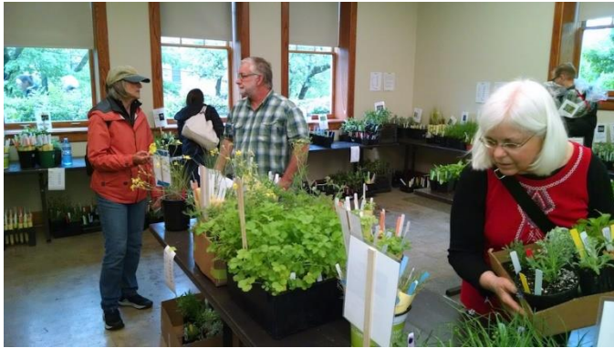
Figure 2 Early setup preparations

The May 18 th Annual Plant Sale was very successful thanks to lots of volunteers who helped from the starting of native plant seeds to the cashiering and cleaning up at the end of the sale. Co-chairs Charlotte and Nancy are very grateful for everyone's help in every phase of the project. Over 2000 native plants were sold and it was exciting to see the enthusiasm of the buyers. The sale cleared over $3000 to add to the chapter's funds which support our grant program and donations.