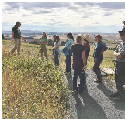
Figure 12 Views of Moscow and a discussion of a future project